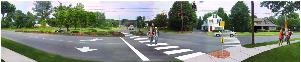
Proposed Enhancement: Gateway treatment, new crosswalk, pedestrian activation, improved sidewalk connections, and pedestrian signal indicators.