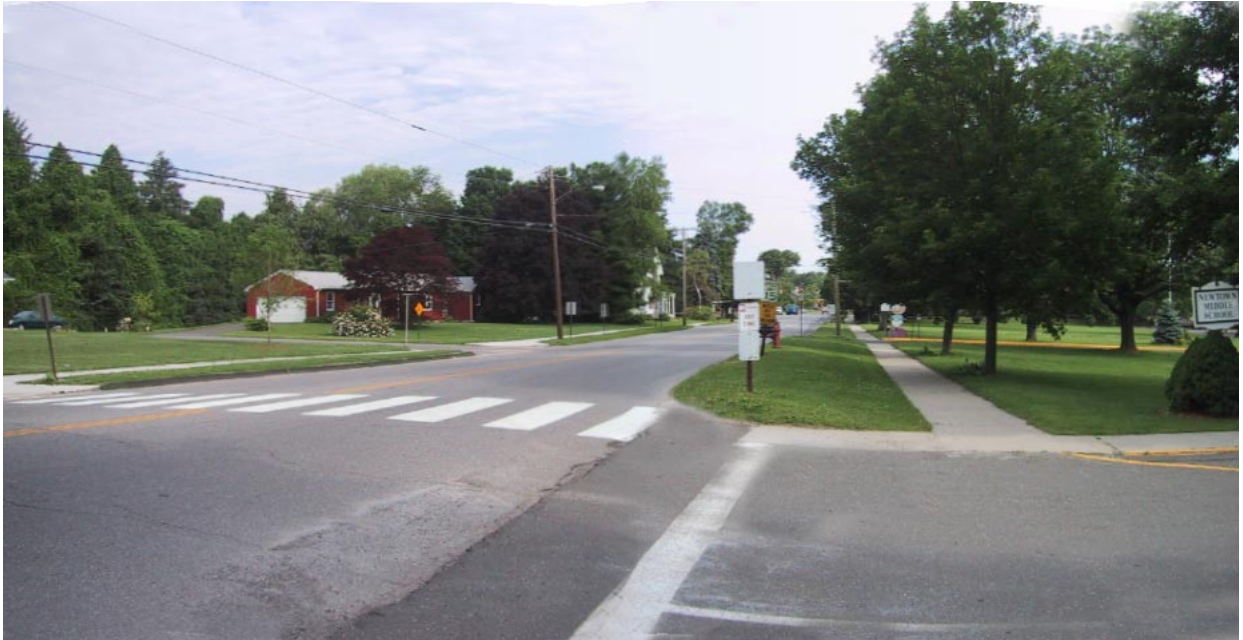
Existing: Queen Street mid-block crossing adjacent to the Middle School