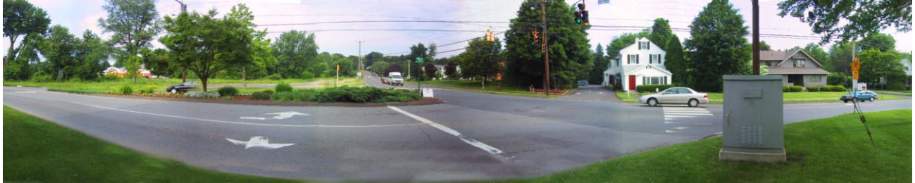
Existing: Intersection of Route 6 and Queen Street. (Queen Street northbound approach to Route 6)