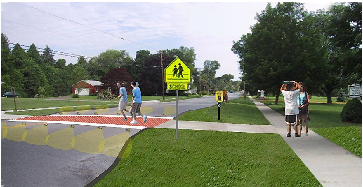
Proposed Enhancements: Raised-textured crosswalk, in-pavement lighting, curb-extensions, improved school zone signage, and reconfiguration of the Middle School main driveway.