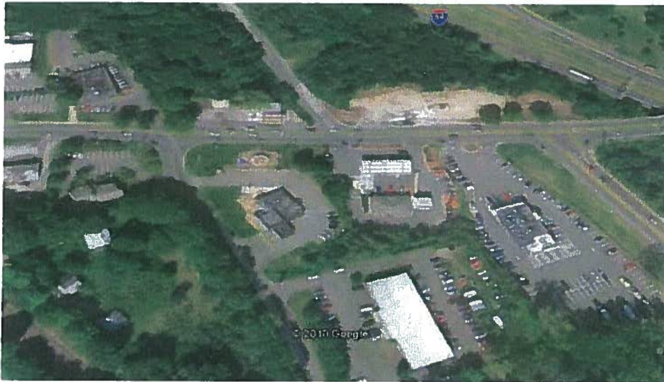
Newtown's Route 6 traffic problem area just west of I-84 Exit 10